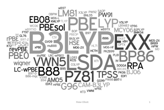
FIG. 3. The alphabet soup of approximate functionals available in a code near you.